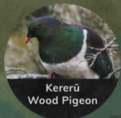
Kererū Wood Pigeon