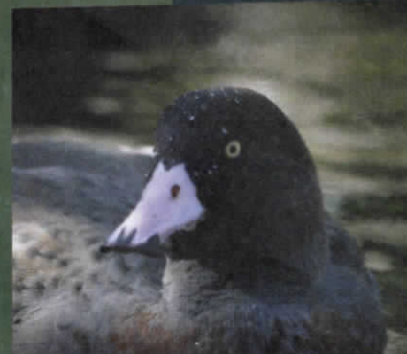
Whio Captive breeding from 1970's