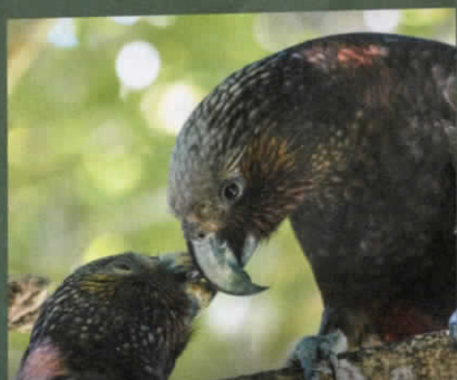
Kākā Released from 1996