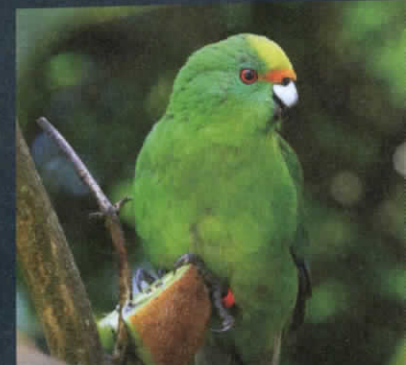
Orange Fronted Kākāriki Captive breeding from 2019