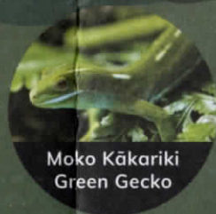
Moko Kākariki Green Gecko