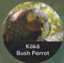
Kākā Bush Parrot

How many of these creatures can you find at Pūkaha?