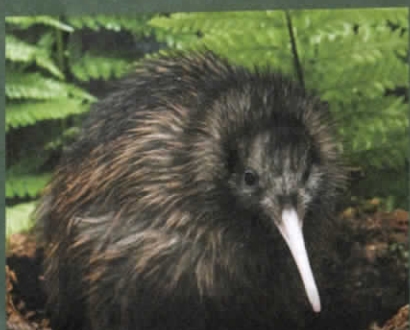
Kiwi Captive breeding from 1982