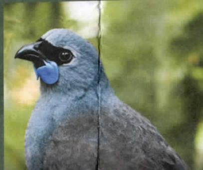
Kōkako Released from 2003